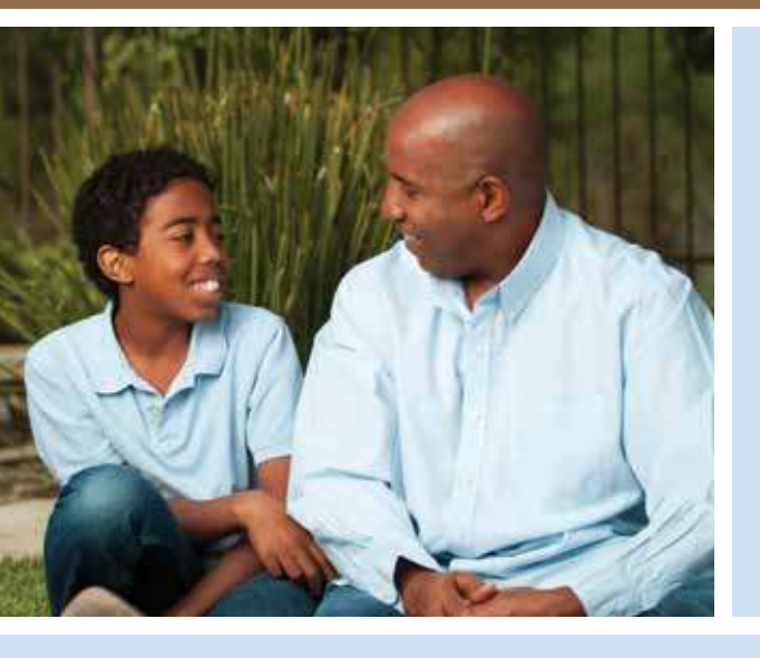
First Steps Starting a mentoring ministry